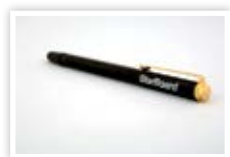
Stylus pen (included)